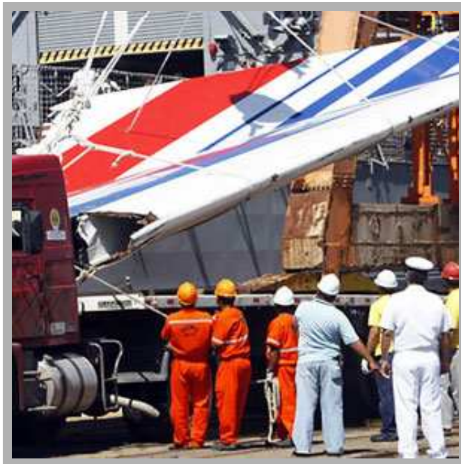
The recovered tailfin of Air France 447 is unloaded from Brazilian Navy frigate Constituicao .